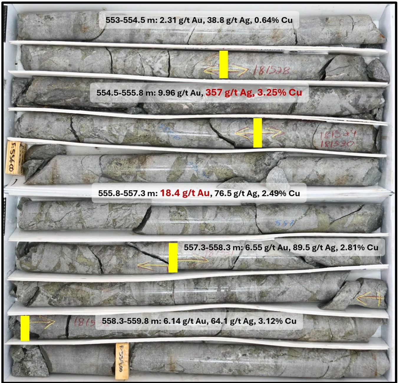
Figure 2: Core photograph from REG-26-35 with sample results labelled.